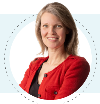
Kristin Sharp, Flex CEO

"App-based platforms have transformed how people earn, shop and get around—from safe transportation options to providing improved access to food and medicine. Flex promotes and advocates for the policies that unlock the full promise of this highly competitive and dynamic industry."